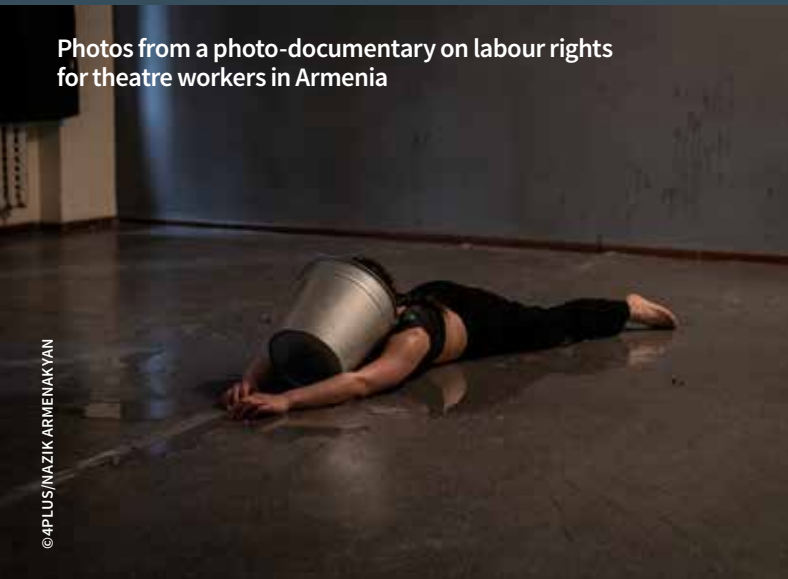
Photos from a photo-documentary on labour rights for theatre workers in Armenia

Mold-Street received start-up funding from EED, while Newsmaker received EED funding in the early stages of development. These are an example of how support to media can have a direct impact on democratic development.